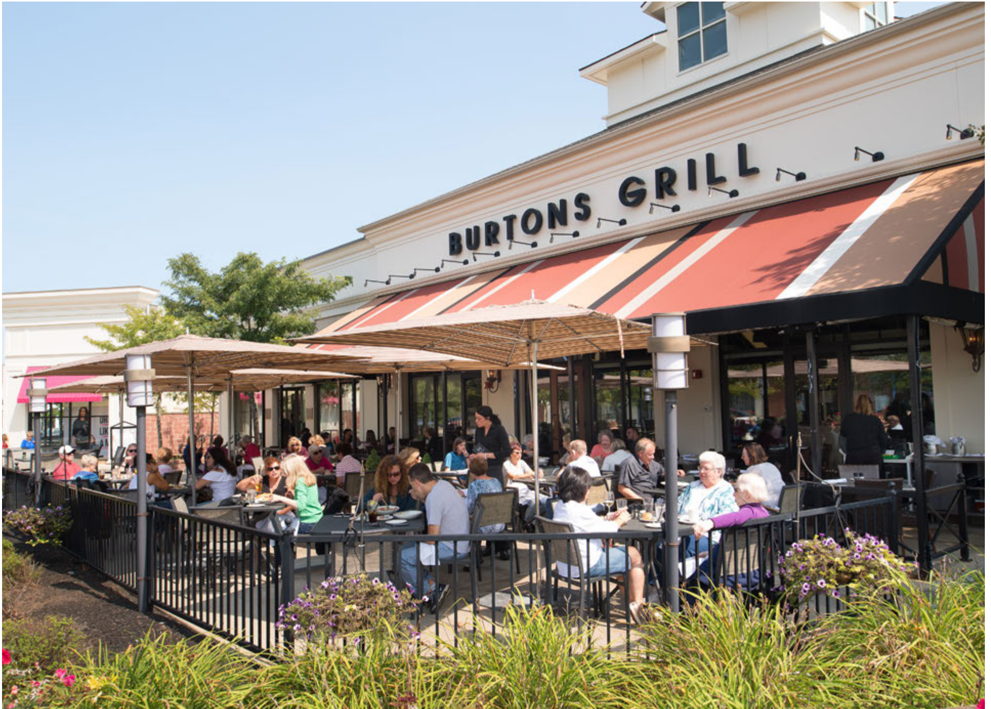
BURTON'S GRILL, A POPULAR LUNCH SPOT, OFTEN SEES A FULL PATIO